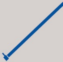
Cem Flex Nozzle & Insertion Tool