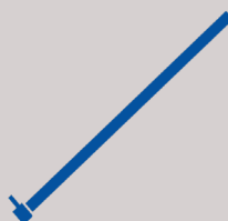
Cem Flex Nozzle & Insertion Tool